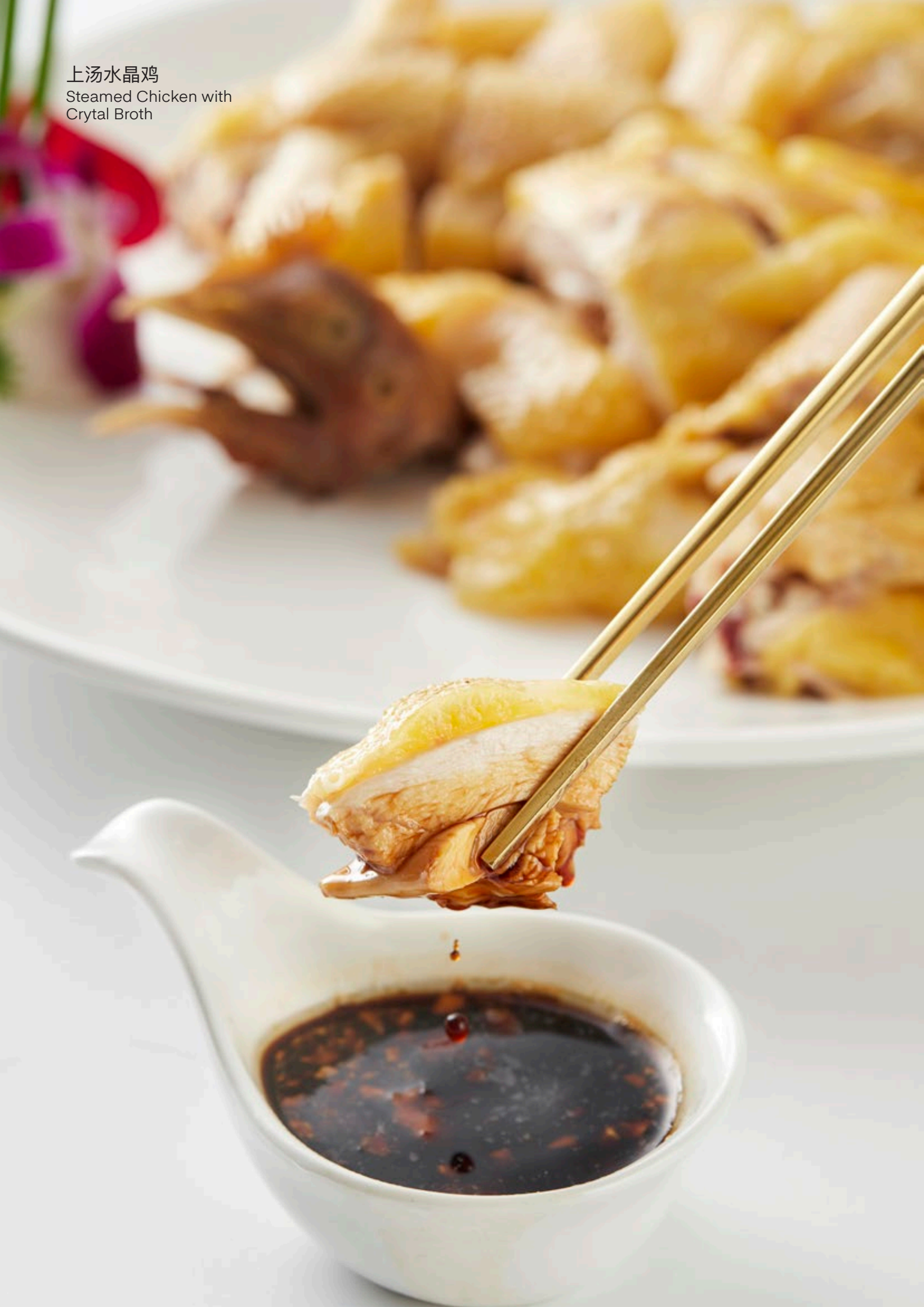
上汤水晶鸡 Steamed Chicken with Crystal Broth