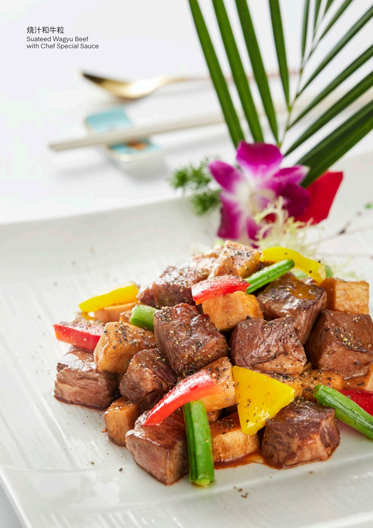
烧汁和牛粒 Suateed Wagyu Beef with Chef Special Sauce